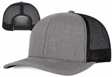
MADDOX MARLED CAP

FABRIC: MARLED COTTON TWILL, STANDARD MESH FEATURES: MADDOX PROFILE, CONSTRUCTED, ADJUSTABLE PLASTIC SNAPBACK CLOSURE