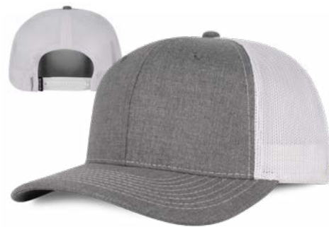
MADDOX MARLED CAP

FABRIC: MARLED COTTON TWILL, STANDARD MESH FEATURES: MADDOX PROFILE, CONSTRUCTED, ADJUSTABLE PLASTIC SNAPBACK CLOSURE