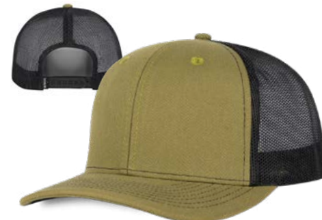
MADDOX COTTON TWILL CAP

FABRIC: COTTON TWILL, STANDARD MESH FEATURES: MADDOX PROFILE, CONSTRUCTED, ADJUSTABLE PLASTIC SNAPBACK CLOSURE