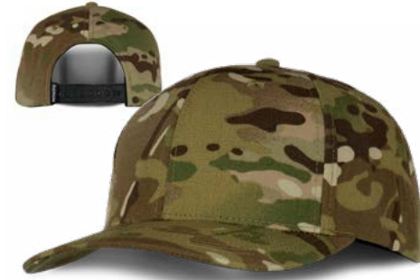
MADDOX CAMO CAP

FABRIC: POLYESTER, STANDARD MESH FEATURES: MADDOX PROFILE, CONSTRUCTED, ADJUSTABLE PLASTIC SNAPBACK CLOSURE