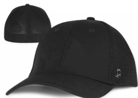
FREE AGENT STRETCH FIT CAP

FABRIC: POLYESTER MICROFIBER, SOFT MESH FEATURES: MADDOX PROFILE, CONSTRUCTED, ADJUSTABLE PLASTIC SNAPBACK CLOSURE