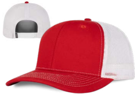
MADDOX COTTON TWILL CAP

FABRIC: MARLED COTTON TWILL, STANDARD MESH FEATURES: MADDOX PROFILE, CONSTRUCTED, ADJUSTABLE PLASTIC SNAPBACK CLOSURE