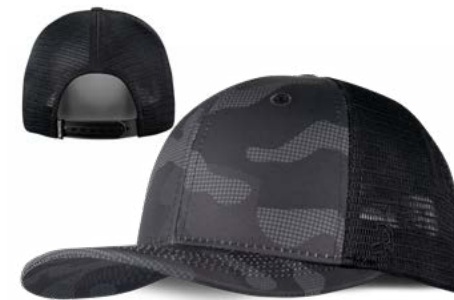
FLETCHER CAMO CAP

FABRIC: POLYESTER MICROFIBER, SOFT MESH FEATURES: MADDOX PROFILE, CONSTRUCTED, ADJUSTABLE PLASTIC SNAPBACK CLOSURE