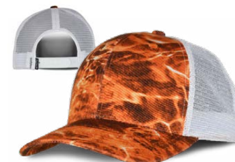
MADDOX CAMO CAP

FABRIC: POLYESTER, STANDARD MESH FEATURES: MADDOX PROFILE, CONSTRUCTED, ADJUSTABLE PLASTIC SNAPBACK CLOSURE