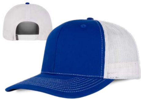
MADDOX COTTON TWILL CAP

FABRIC: POLYESTER MICROFIBER FEATURES: MADDOX PROFILE, CONSTRUCTED, ADJUSTABLE PLASTIC SNAPBACK CLOSURE, LASER CUT FRONT PANELS