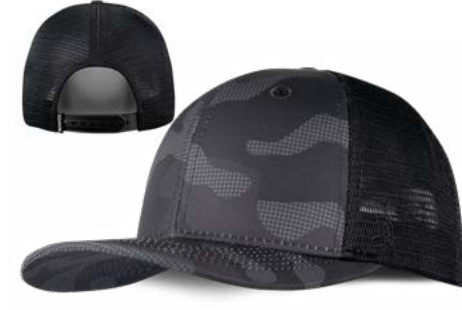
FLETCHER CAMO CAP

FABRIC: POLYESTER, STANDARD MESH FEATURES: MADDOX PROFILE, CONSTRUCTED, ADJUSTABLE PLASTIC SNAPBACK CLOSURE