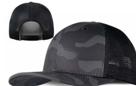
FLETCHER CAMO CAP

FABRIC: POLYESTER MICROFIBER, SOFT MESH FEATURES: MADDOX PROFILE, CONSTRUCTED, ADJUSTABLE PLASTIC SNAPBACK CLOSURE