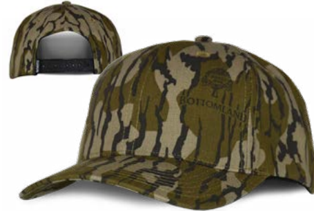
MADDOX CAMO CAP

FABRIC: POLYESTER, STANDARD MESH FEATURES: MADDOX PROFILE, CONSTRUCTED, ADJUSTABLE PLASTIC SNAPBACK CLOSURE